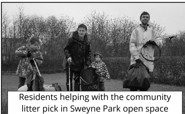
Residents helping with the community litter pick in Sweyne Park open space

Protecting our local environment for future generations is high on my agenda. With reductions in Council budgets, litter removal from our open spaces isn't as good as it could be. We recently organised a community litter pick in Sweyne Park to lend a helping hand to remove a lot of rubbish that has accumulated over several months. Despite the bad weather we had a good turn out from volunteers and cleared a lot of rubbish.